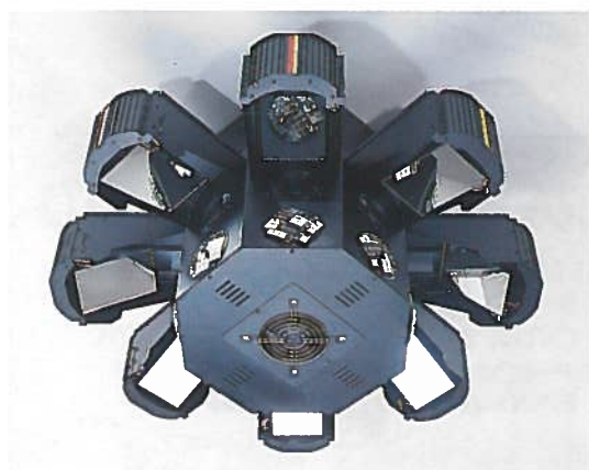
Lampo's new centre-piece, Domingo.

Tiny versions of Apollo, Derby, Corallo, Music Cone and Steady Cone are also available, and all