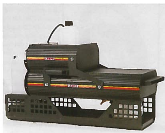
The new Low Smoke Machine.