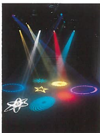
The Columbus effect in action.