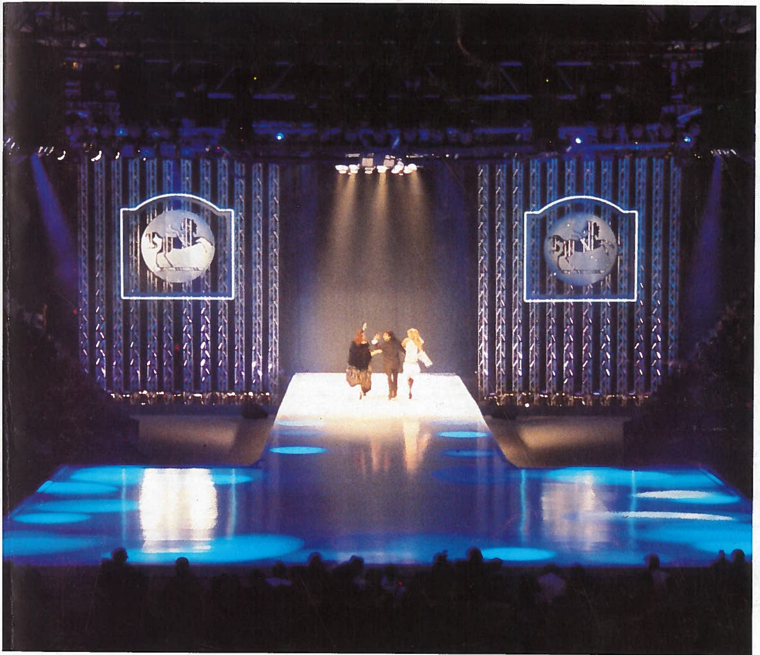
THE CLOTHES SHOW LIVE AT THE NEC, BIRMINGHAM