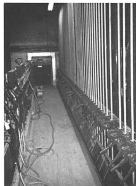
The new operator gallery with re-positioned rope locks - originally at stage level.