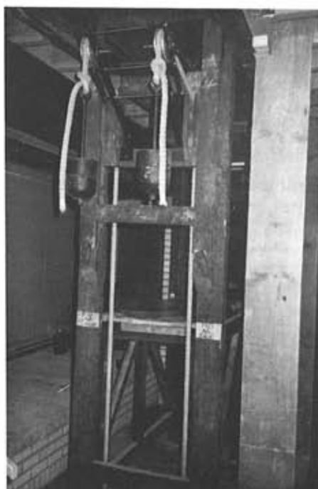
The original coffin trap has been preserved.