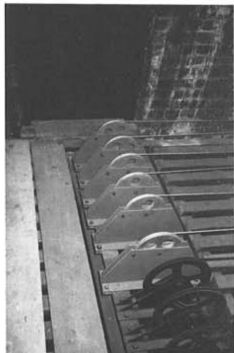
The new counterweight sets.

To retain the theatricality of the venue, two star traps and a coffin trap (circa 1926) were taken out for refurbishment and then refitted into a revised position. A nice idea, providing no very ancient pantomime performer thinks they are still in the same place!