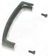
27 211 10 : Rear Grab Handle, 130mm