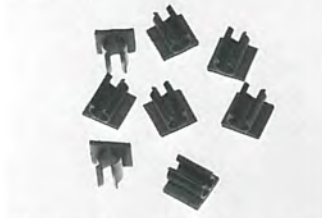
27 243 05 : Power Cable Clip, pkt. 10