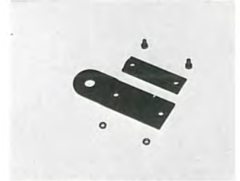
27 242 26 : Safety Bond Anchorage, pkt. 5