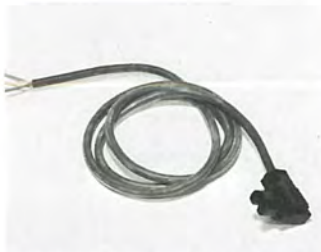
35 000 00 : 1.5m Power Cable, wire-end 35 002 01 : 1.5m Power Cable, 15A 3-pin 35 001 06 : 1.5m Power Cable, Schuko