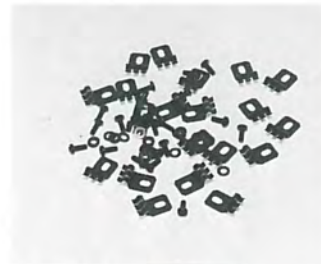
27 852 71 : Lens Clips, pkt. 20