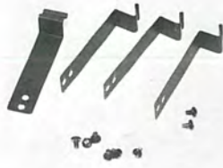
27 242 0T : Colour Runner Safety Catch, pkt. 5