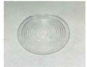
27 509 02 : 150mm dia. Fresnel Lens

27 234 89 : Lampray Knob, pkt. 5 27 242 34 : Tilt Disc Clamp Assby, pair 27 243 13 : Fixing Screw Pack, pkt. 60