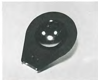
27 236 04 : Spherical Reflector