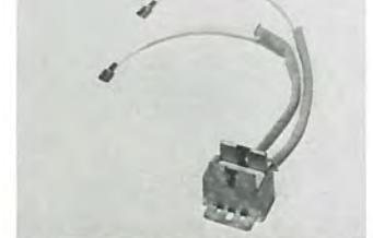
27 734 14 : GX9.5 Lampholder