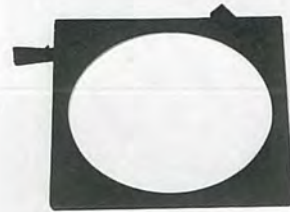
27 262 04 : 185 x 185mm Colour Frame