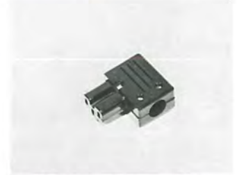
35 004 02 : Power Socket, terminals