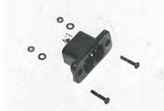
27 223 00 : Power Inlet Connector