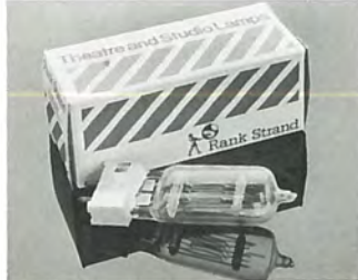
34 219 0T : 1000W 240v RSE/19 Lamp 34 219 18 : 1000W 220v RSE/19 Lamp 34 222 09 : 1000W 240v RSE/70 Lamp 34 222 17 : 1000W 220v RSE/70 Lamp