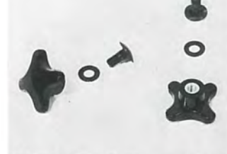
27 225 1T : Tilt Lock 80mm Handwheel, pkt. 2