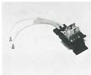
27 234 97 : Lampholder Slide Assembly