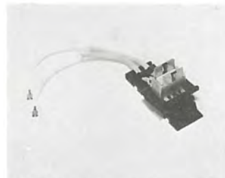
27 234 97 : Lampholder Slide Assembly