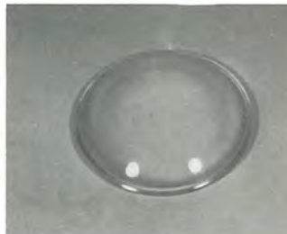
27 515 08 : 150mm dia. Prism Convex Lens

27 234 89 : Lampray Knob, pkt. 5 27 242 34 : Tilt Disc Clamp Assby, pair 27 243 13 : Fixing Screw Pack, pkt. 60