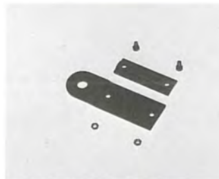
27 242 26 : Safety Bond Anchorage, pkt. 5