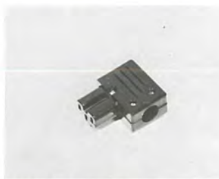
35 004 02 : Power Socket, terminals