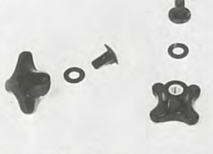
27 225 1T : Tilt Lock 80mm Handwheel, pkt. 2