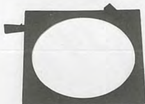
27 262 04 : 185 x 185mm Colour Frame