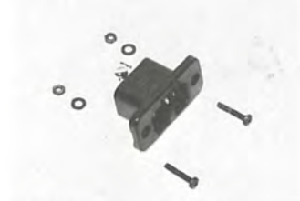
27 223 00 : Power Inlet Connector