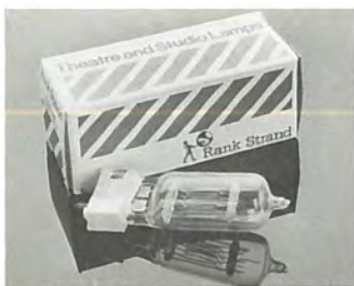
34 219 0T : 1000W 240v RSE/19 Lamp 34 219 18 : 1000W 220v RSE/19 Lamp 34 222 09 : 1000W 240v RSE/70 Lamp 34 222 17 : 1000W 220v RSE/70 Lamp