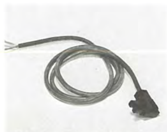
35 000 00 : 1.5m Power Cable, wire-end 35 002 01 : 1.5m Power Cable, 15A 3-pin 35 001 06 : 1.5m Power Cable, Schuko