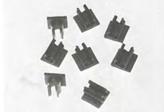
27 243 05 : Power Cable Clip, pkt. 10