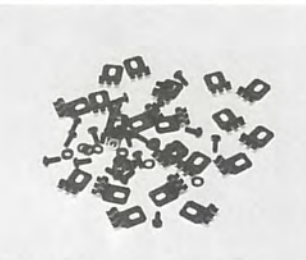
27 852 71 : Lens Clips, pkt. 20