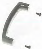
27 211 10 : Rear Grab Handle, 130mm