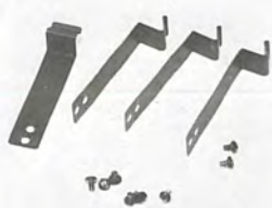
27 242 0T : Colour Runner Safety Catch, pkt. 5