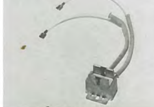
27 734 14 : GX9.5 Lampholder