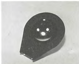
27 236 04 : Spherical Reflector